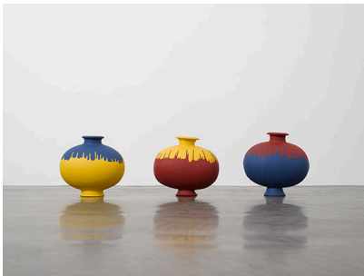
Exhibit Model Detail with Additional Information VIII 2020 Inkjet print on aludibond in grey shadowbox frame with objects 162.7 x 113.7 x 19 cm 64 x 44 3/4 x 7 3/8 in MONK200007