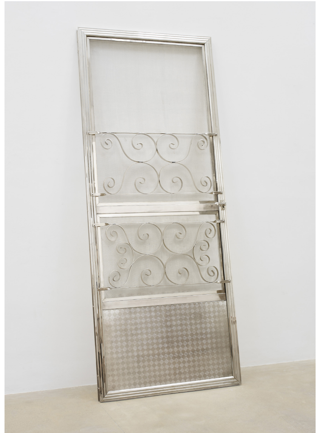
Right: Screen Door , 2005

Rodney Graham was born in Abbotsford, British Columbia, Canada in 1949. He lives and works in Vancouver. Solo shows include Museum Frieder Burda, Baden-Baden, Germany (2017); Museum Voorlinden, Wassenaar, Netherlands (2017); BALTIC Centre for Contemporary Art, Gateshead, UK (2017); Le Constortium, Dijon, France (2016); Sammlung Goetz, Munich, Germany (2015); Emily Carr University of Art and Design, Vancouver, Canada (2014); Vancouver Art Gallery, Canada (2012); Museum der Moderne, Salzburg, Austria (2011); Museu D'Art Contemporani de Barcelona, Spain (2010); Jeu de Paume, Paris, France (2009); Museum of Contemporary Art Los Angeles, CA, USA (2004); Whitechapel Art Gallery, London, UK (2002); Hamburger Bahnhof, Berlin, Germany (2001); and Kunsthalle Wien, Vienna, Austria (1999). He has participated in group shows such as the Carnegie International (2013); the 13th, 14th and 17th Sydney Biennales, Australia (2002, 2006, 2010); the Whitney Biennial, New York, USA (2006); and the Lyon Biennale, France (2003). He represented Canada at the 47th Venice Biennale, Italy (1997) and has received the Gershon Iskowitz Prize, Toronto, Canada (2004); the Kurt Schwitters-Preis, Niedersächsische Sparkassenstiftung, Germany (2006); and the Audain Prize for lifetime achievement in visual arts, British Columbia, Canada (2011). In 2016, Rodney Graham was appointed an Officer of the Order of Canada for his contributions to Canadian contemporary art.