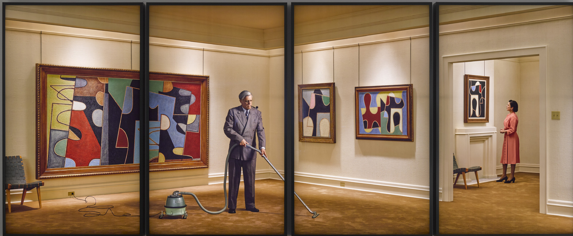
Vacuuming the Gallery 1949, 2018 Four painted aluminium lightboxes with transmounted chromogenic transparencies 244 x 183 cm (each) 96 1/8 x 72 in (each)