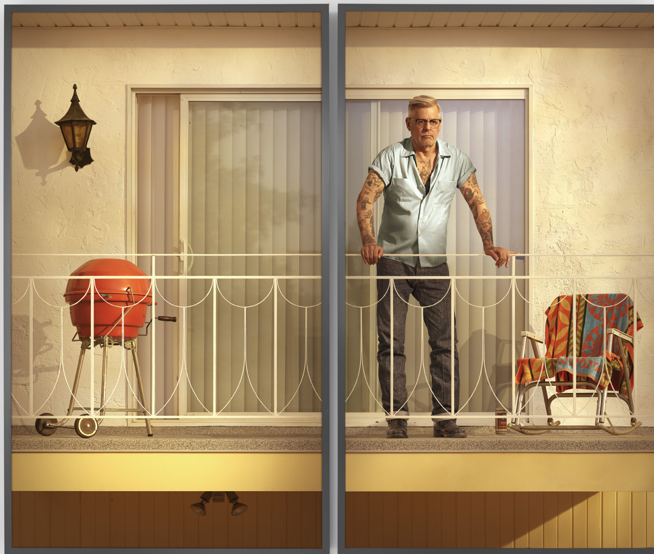
Tattooed Man on Balcony, 2018 Painted aluminum lightbox with transmounted chromogenic transparency 305 x 183 cm (each) 120 1/8 x 72 in (each)