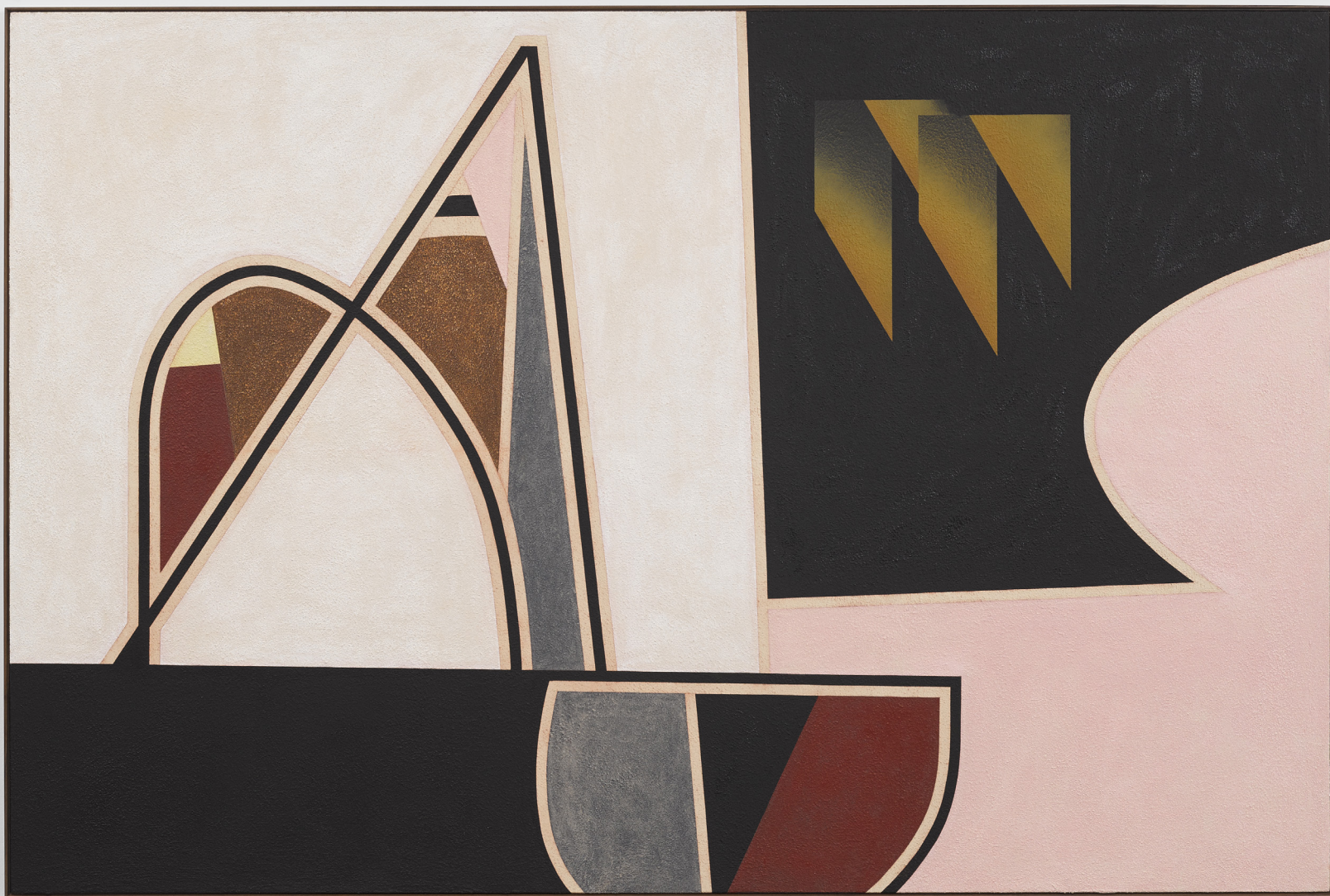
Untitled , 2018 Oil and sand on canvas 185.4 x 276.8 cm (framed) 73 x 109 in (framed)